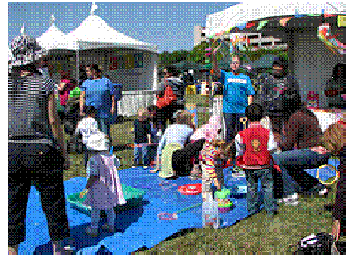
Click here to view more photos from the 2009 San Jose Children's Faire

Mark your calendar now for the San José Children's Faire, to be held 10:30 a.m. to 3:00 p.m. on Saturday, April 24 at Discovery Meadow (in front of the Children's Discovery Museum) in downtown San Jose. "Going Wild with Nature: Adventures in Our Backyard" is the theme for this year's annual event, which features family-oriented stage entertainment, special attractions, and activity booths offering hands-on activities for children, ages two to 12, in addition to information about education, child care, health and safety resources, creative arts and recreational programs. Check out the children's art displays, providing insight into the imagination and development of young children. The Faire— a free, one-day, outdoor festival highlighting April's "Month of the Young Child" celebration—is designed to link parents and caregivers of young children with community organizations that serve their needs.